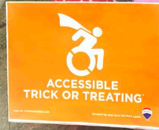
The Padulo Family Treat Accessibly Founders