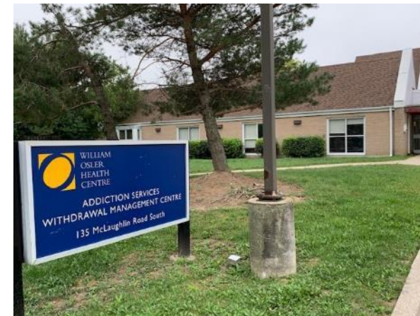
Withdrawal Management Centre