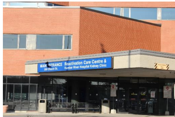
Reactivation Care Centre