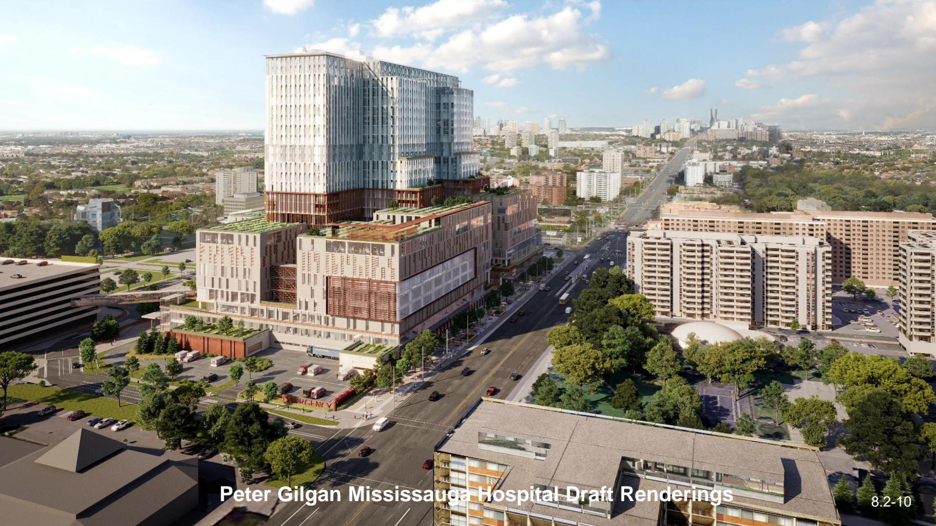
Peter Gilgan Mississauga Hospital Draft Renderings