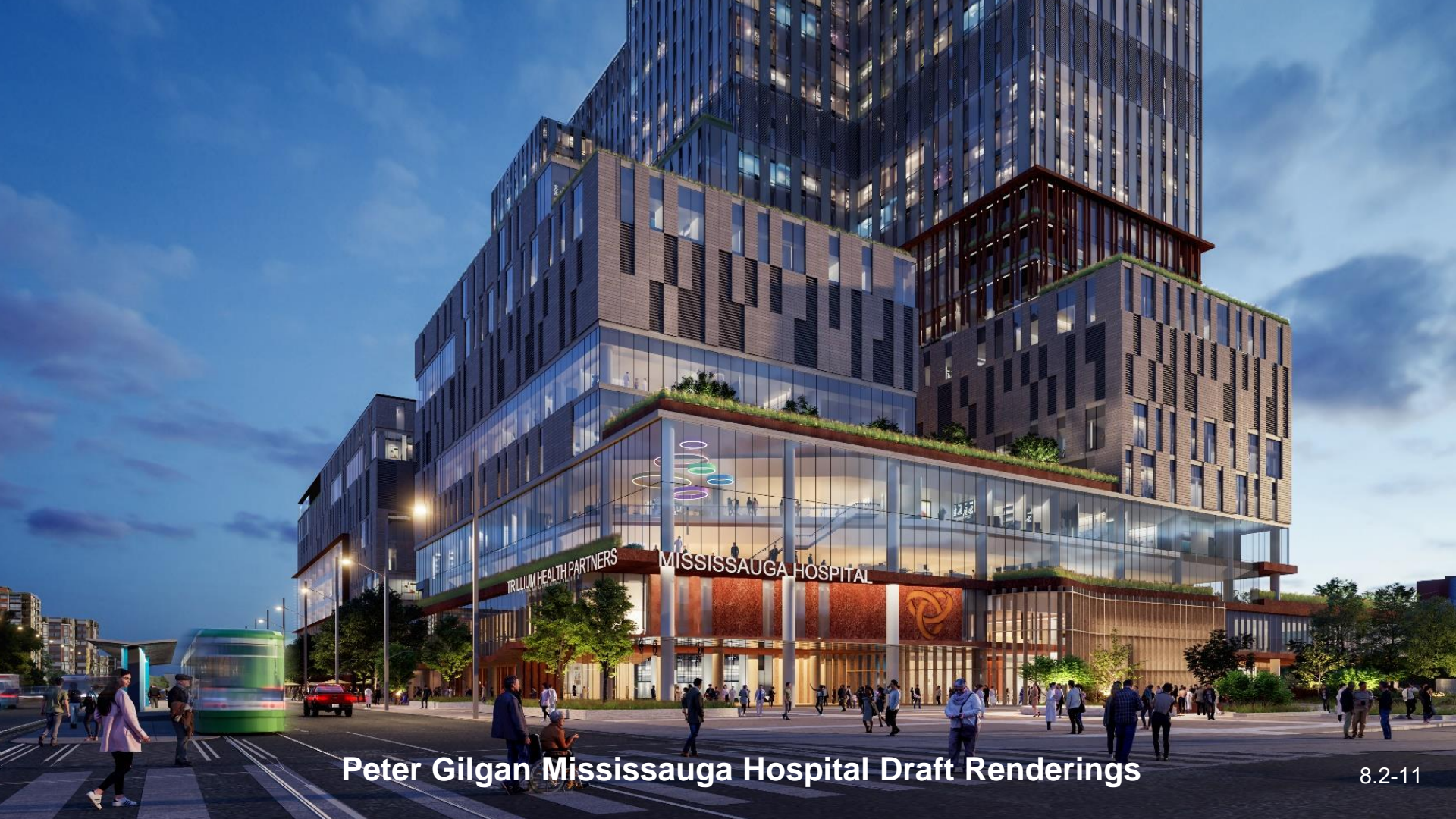
Peter Gilgan Mississauga Hospital Draft Renderings