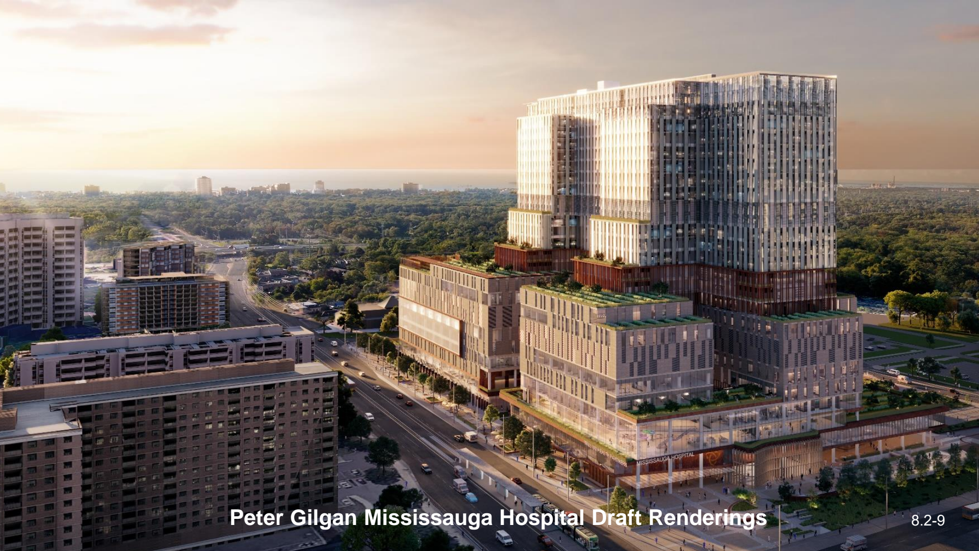
Peter Gilgan Mississauga Hospital Draft Renderings