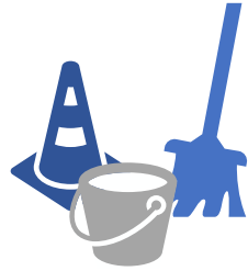
enhanced cleaning & safety measures