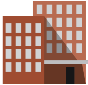
multi-unit residential buildings