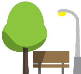
specified public spaces