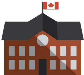
public & private schools