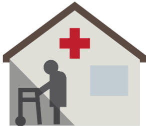
specified retirement & long-term care homes