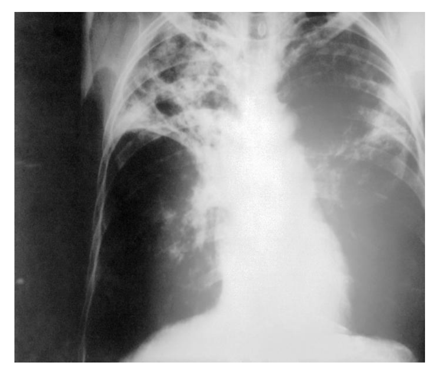
An anteroposterior X-ray of a patient diagnosed with advanced bilateral pulmonary tuberculosis.