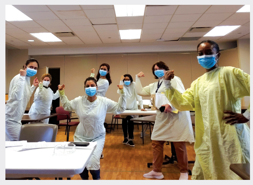
Peel Region Long Term Care superherge

Through an Integrated Response Table, the Region has adopted a multi-agency approach, which includes representation from the Central West and Mississauga Halton LHINs, Peel Region Public Health, Peel Region Paramedic Services and local hospitals (Trillium Health Partners and William Osler Health System). This group continues collaborating on the development and