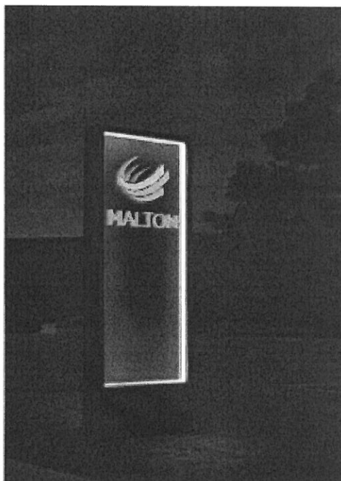
2.1 - Gateway ID Large Reflectivity - Night time Render View 010