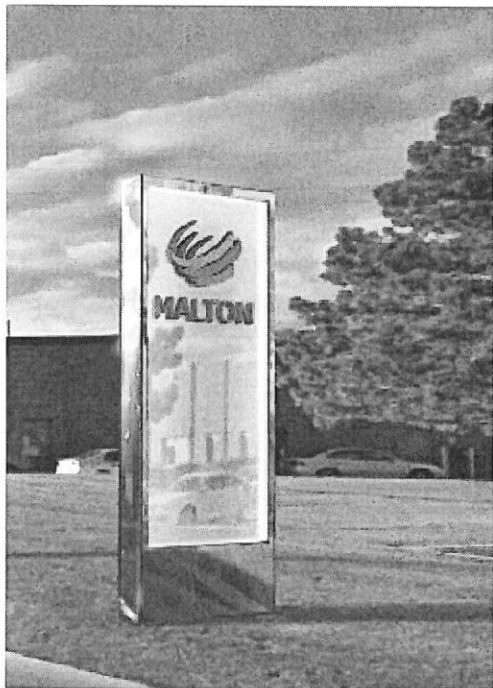
2.1 - Gateway ID Large Reflectivity - Day time Render View 010