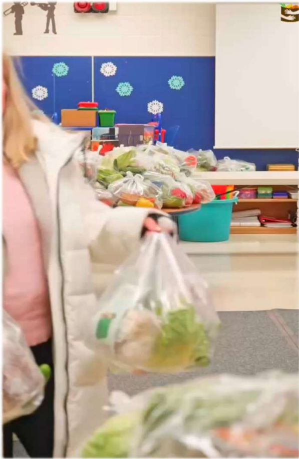
Ward 5 Malton, Mississauga