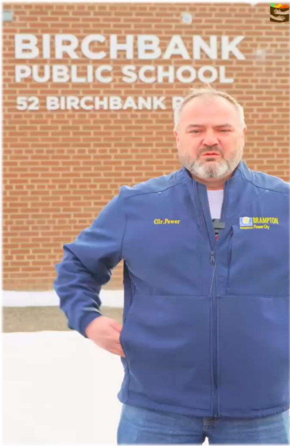
Ward 7 & 8, Brampton