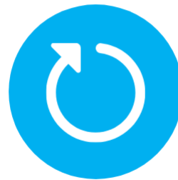
Resumption of Services and Recovery of Backlog