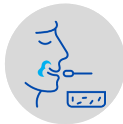
Testing Strategy & Lab Network