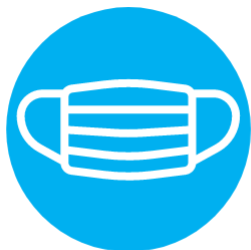
Clinical Supplies & Equipment