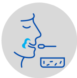
Local Testing strategy