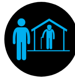
Preparing Congregate Settings

Partners in the Region have been working collaboratively to plan for a second wave of the pandemic.