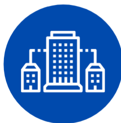
Integrated Capacity Planning